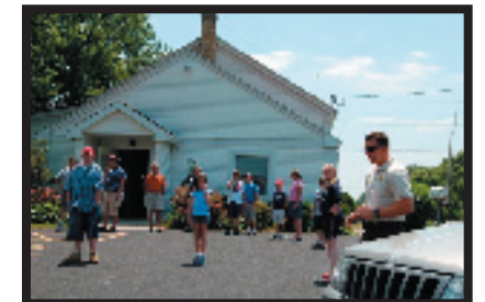
Measuring 200 foot wake zone