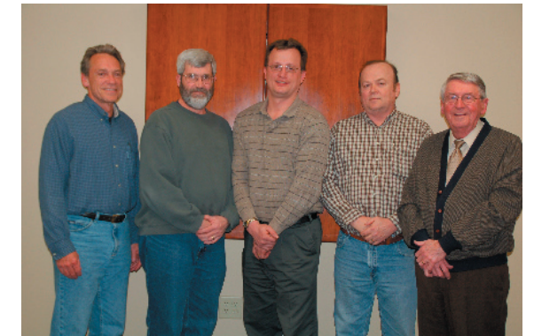
(Pictured From Left To Right)