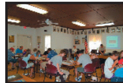
Students hard at work in the classroom

A: The site is up now – www.kegonsa.org - with modifications and additions as they are suggested